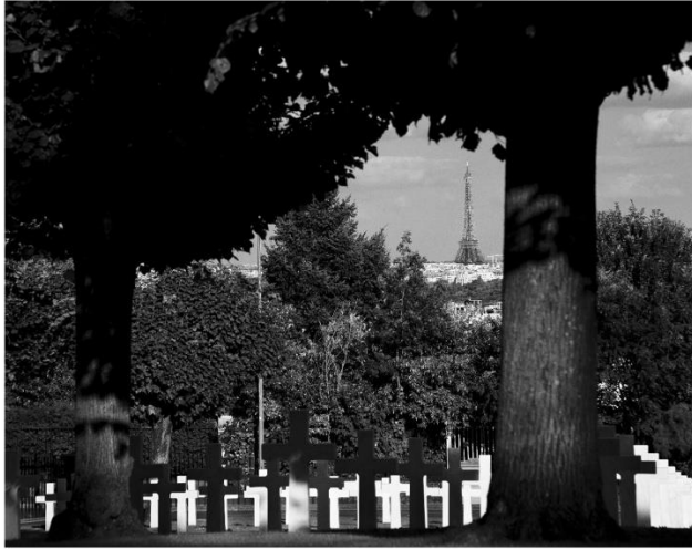
SURESNES AMERICAN CEMETERY

(ABMC) maintains 26 permanent American military cemeteries, 31 federal memorials, monuments and markers, in 17 countries throughout the world. They continue to care 24/7/365 for more than 200,000 American service members still Over There .